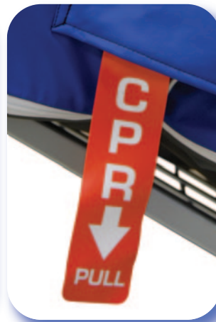
Highly visible rapid C.P.R. deflation