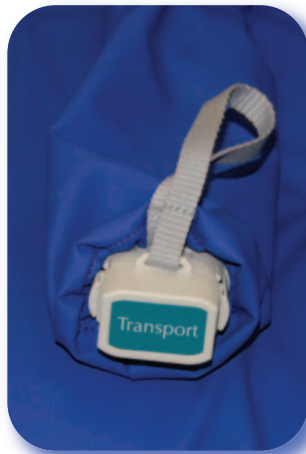
Simple transport facility