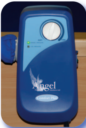
Light compact power unit